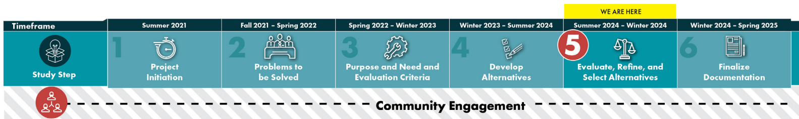
Figure: 2 Project Schedule

The team has additionally conducted traffic modeling and gathered other data, both of which affect the refined alternative designs. Next steps include collecting public comments on the refined alternatives. This feedback will guide the team to a recommended alternative and draft PEL Study document, which will be made available for public comment prior to delivering a final PEL Study document.