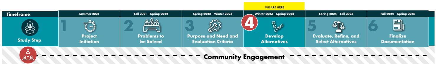
Figure: 2 Project Schedule

Once the final PEL Study is complete, the project may move into additional environmental review and design through the National Environmental Policy Act process. Funding for construction projects would be determined after the PEL Study is complete.