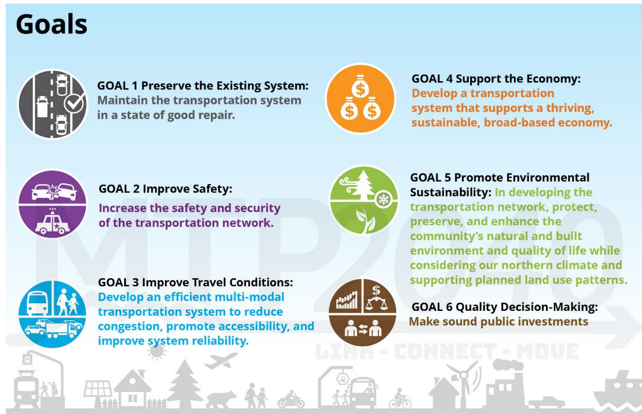
Figure 3. MTP 2040 Goals

The project team, with input from community members and stakeholders during an alternatives development workshop, will develop the preliminary alternatives with sufficient detail to allow use of the study travel demand model to forecast future travel volumes and associated travel metrics for use in the Level 1 screening process. These data for each of the preliminary alternatives will enable the project team to apply certain Level 1 screening criteria that require model results.